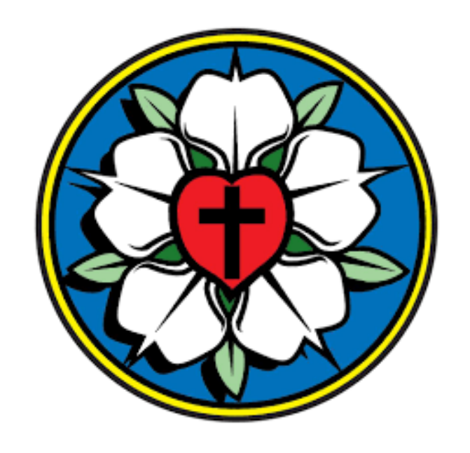
St. Paul Lutheran Church & Preschool, LCMS Declaring & Teaching – Jesus is Lord! September 27<sup>th</sup>, 2020