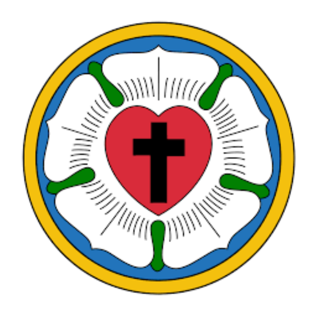
St. Paul Lutheran Church & Preschool, LCMS Declaring & Teaching – Jesus is Lord! August 23<sup>rd</sup>, 2020